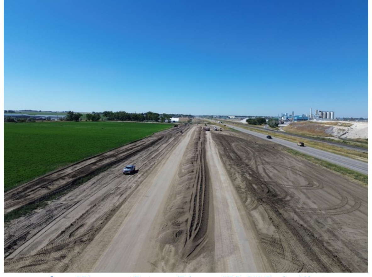
Gravel Placement Between Taber and RR 163 Facing West