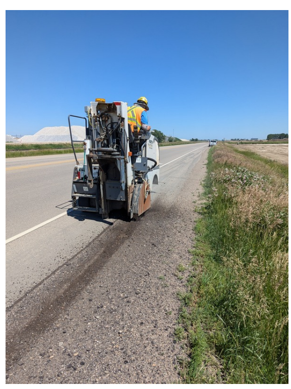
Saw Cutting and Removing Field Access Between Taber and RR 163 Facing East