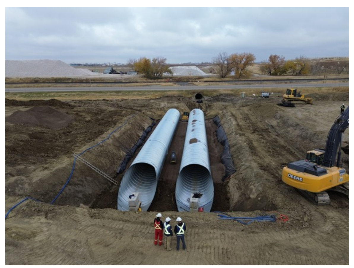
Bridge Structure 1-2 Under East Bound Lane Between Taber and RR 163 Facing North