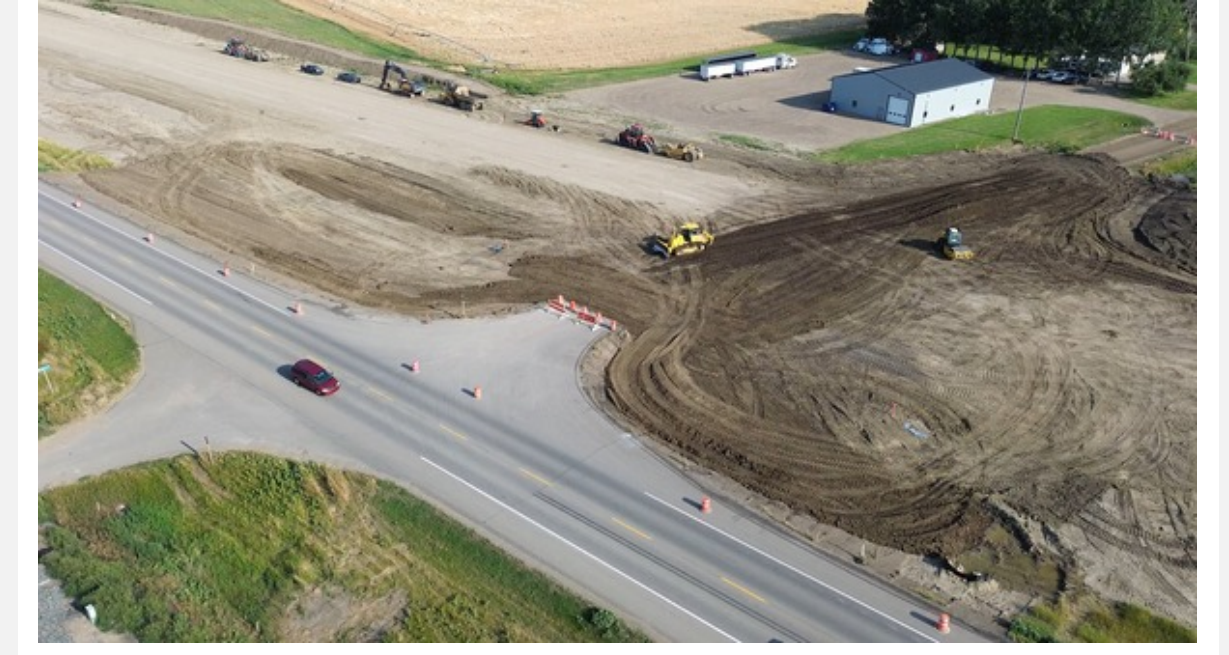
Intersection Widening and Subcut at RR 163 Facing South