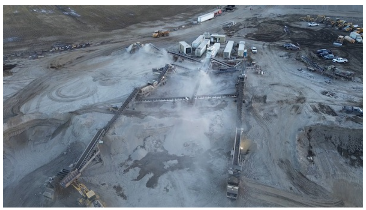
Gravel Crushing Commencing at Fincastle Pit Facing SW