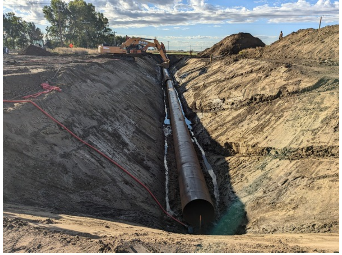
Lateral 20 Future Pipeline Casing Between RR 154 and 155 Facing South