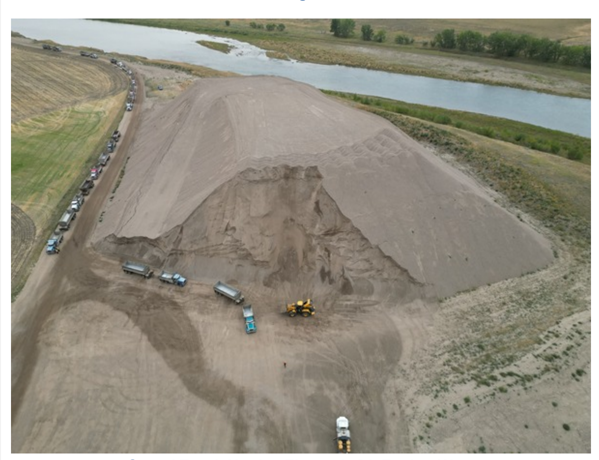
Gravel Truck Haul at Fincastle Pit Facing West