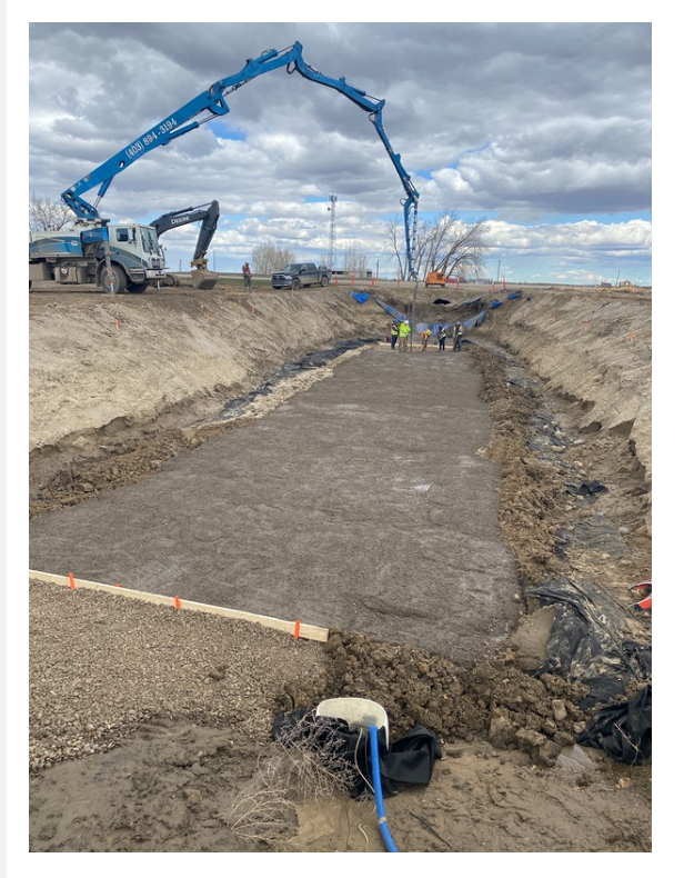
Pouring Concrete Slab on Structure 6 Due to High Ground Water Table South of Purple Springs Facing North