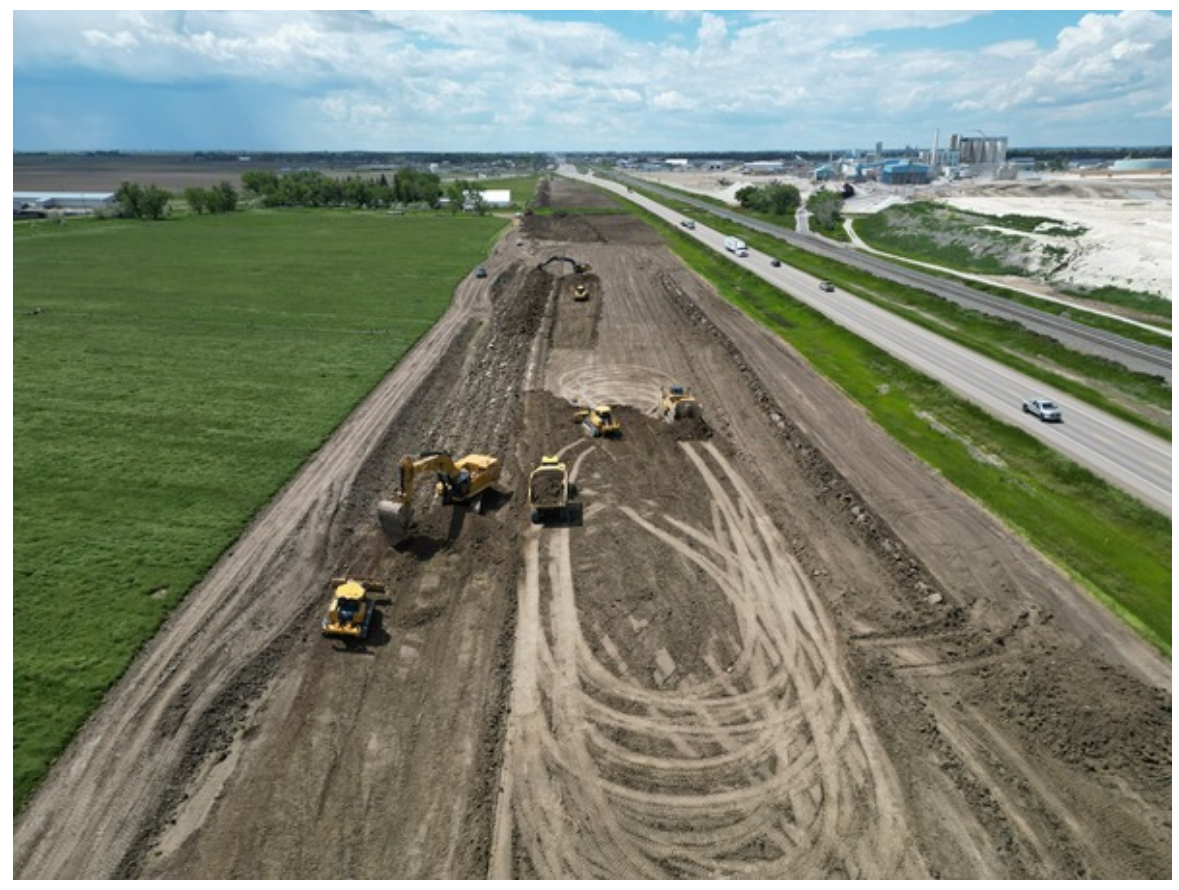
Ditch Cut and Subgrade Construction Between Taber and RR 163 Facing West