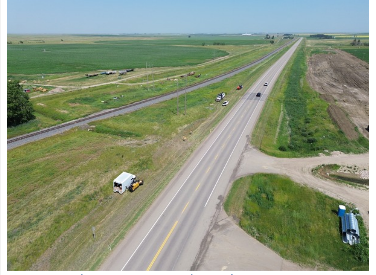
Fiber Optic Relocation East of Purple Springs Facing East