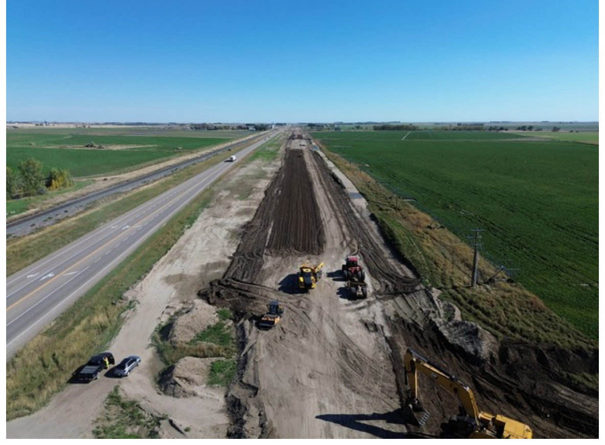
Subgrade Disking and Compacting Prior to Gravel Placement at RR 160 Facing East