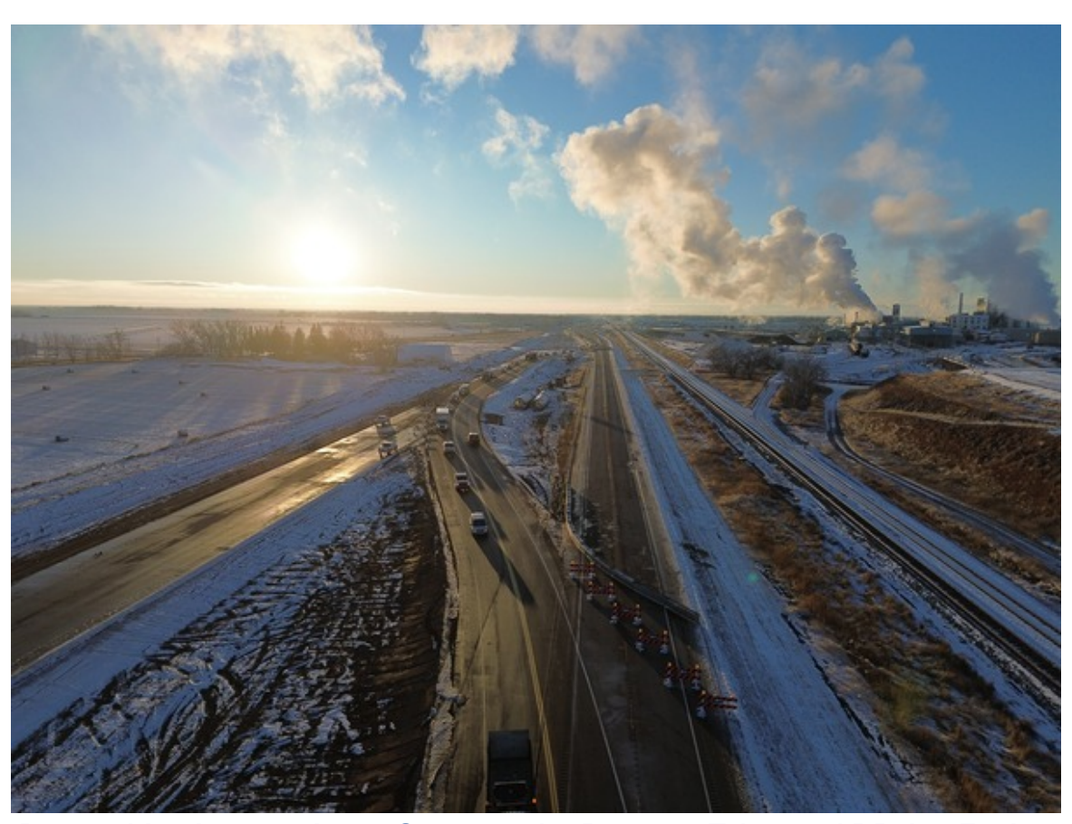
Detour 1 Implementation at Structure 1-2 Between Taber and RR 163 Facing West