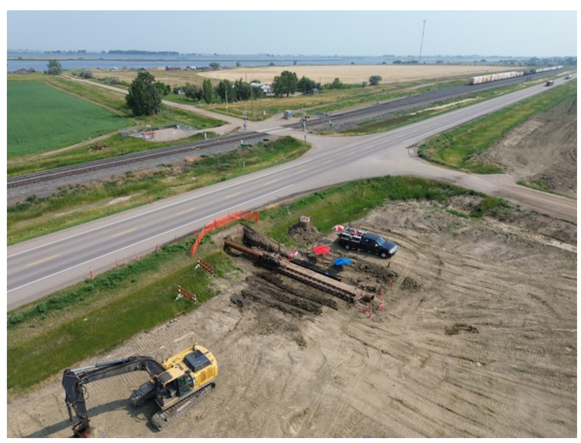
Culvert Bore Beneath Existing Highway at RR 163 Facing NE